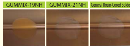
No flux produced

Evaluated Method: A test piece is used from the cross-cut test. The copper board is bent 90 degrees and residual flux cracks are observed.