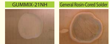
No flux produced

A test piece is used from the solder spread method and placed in a refrigerator for 48 hours at -20°C. Afterward residual cracks are observed.