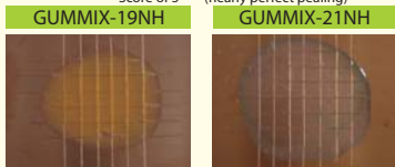
Score of 1

Evaluated Method: in accordance with JIS-K-5600-5-6 Methods Criteria: Score of 0 (No peeling) Score of 1 (less than 5% peeling) Score of 2,3,4 (more than 5% peeling) Score of 5 (nearly perfect peeling)